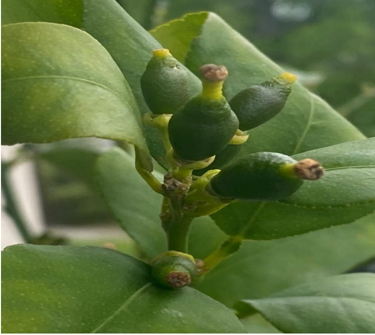
These are limes growing on a potted lime tree.